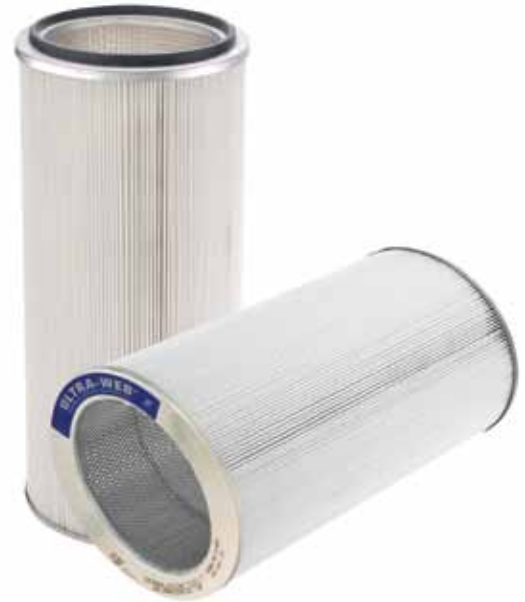
Ultra-Web® SB Cartridge