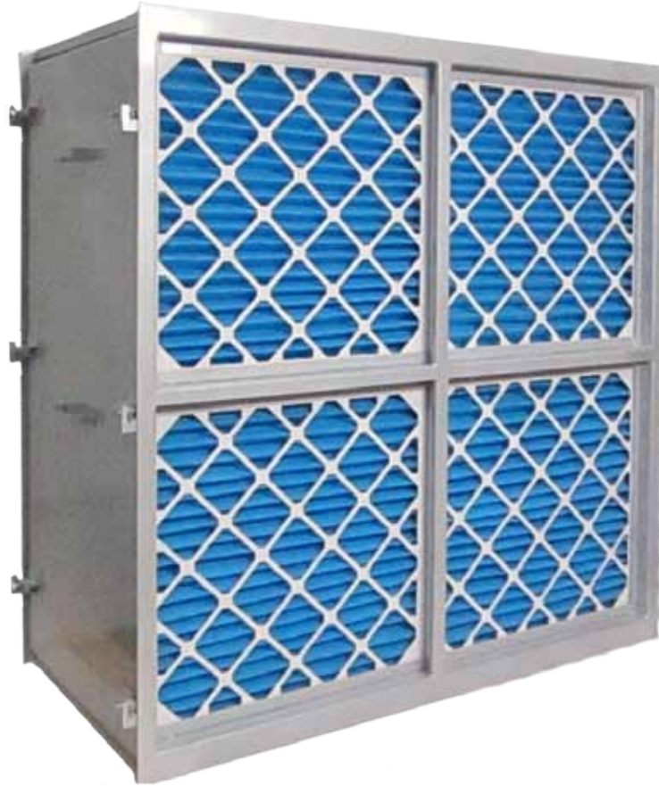
2x2 Ultra-Lok housing with a filter in the upper-right corner

Typically installed on the exhaust of the fan